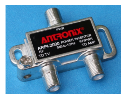
Optional Power Inserter

Approvals include RoHS, UL, CE, FCC and the EMC requirements of FCC part 15.