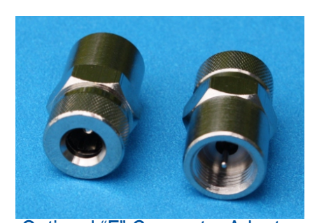
Optional "F" Connector Adapter