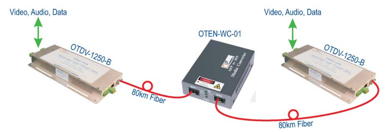
Figure 1 — Typical Application of an OTEN-WC-01 as a Digital Signal Booster

The OTEN-WC-01 includes two SFP ports. Operation is protocol independent, and the modules easily convert between dissimilar fiber modes and wavelengths. The small form factor is hot swappable. The unit offers a very compact size and multiple mounting options.