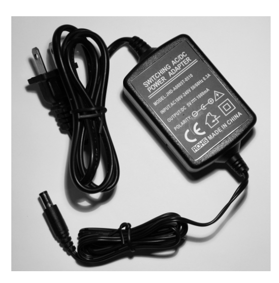
Typical AC Power Supply (Ships with Unit)