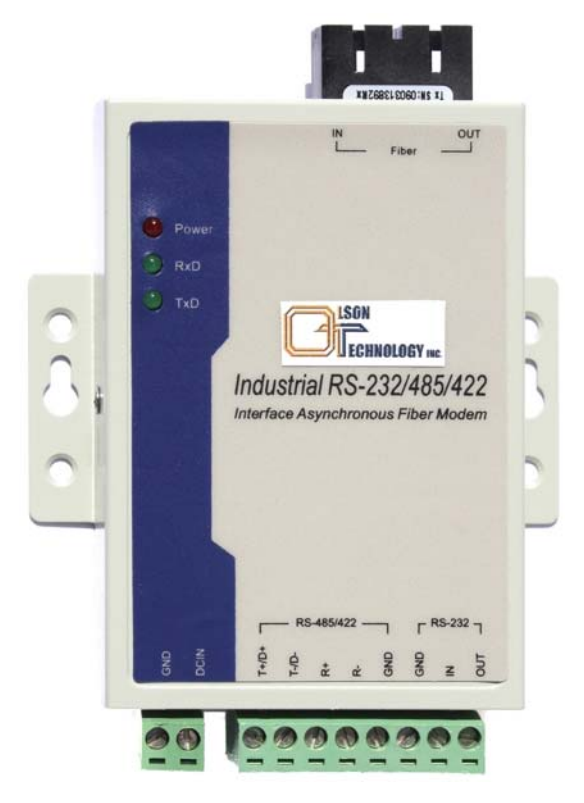
Figure 2 — PIN Locations and LED's